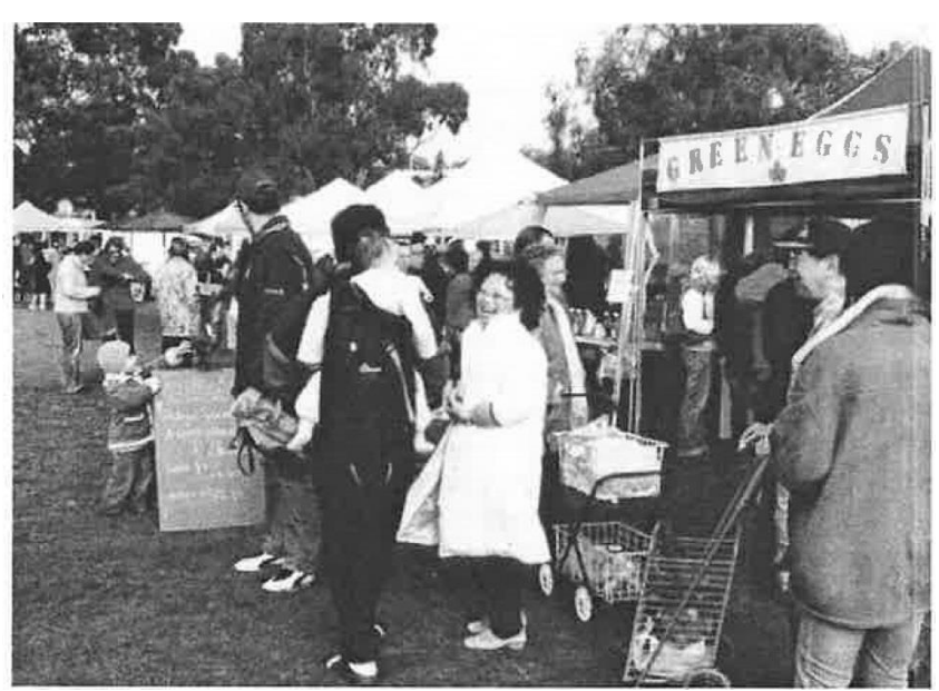
The Boroondara Farmers Market in operation in Patterson Reserve, Hawthorn

To market, to market: Boroondara Farmers Market. A joint project between the Rotary Club of Glenferrie and the City of Boroondara